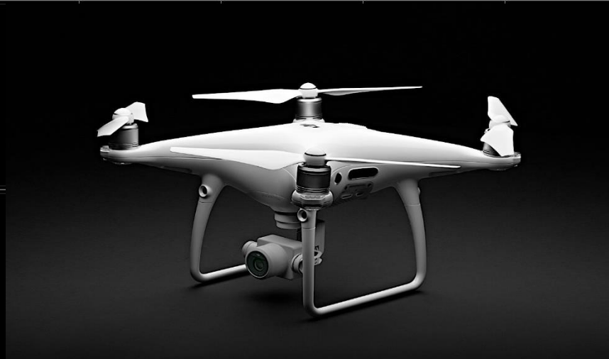
空拍用 dji p4p