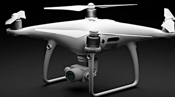
空拍用 dji p4p